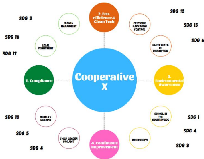
Figure 3 - SDG cooperatives "X" and related

Through processes of cooperation and aggregation, the management of social issues increases the bond between organizations and society, even if conflicts between stakeholder concerns may occur.